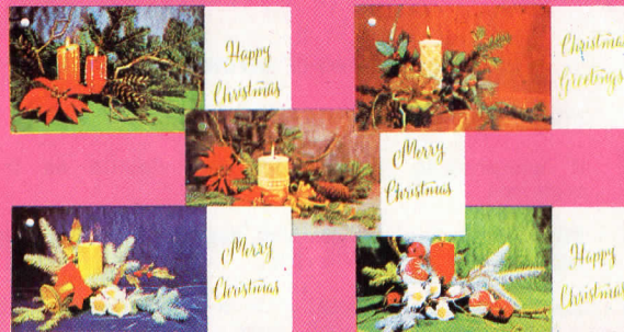
Gift Tags - available in packets of 5 assorted - 7p per pack