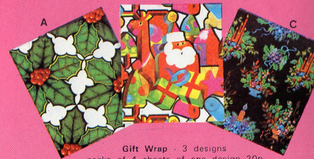
Gift Wrap - 3 designs packs of 4 sheets of one design 20p State design A, B or C when ordering

The Greeting in all cards is:— With Best Wishes for Christmas and the New Year