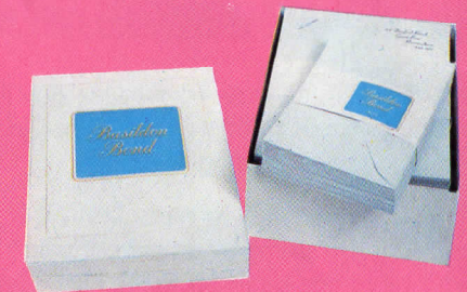
A Cabinet of Duke size (7" x 5½") Basildon Bond notepaper and envelopes for your friends each sheet printed with their address and tel. number price per cabinet £2.95