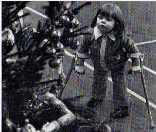
Independent Newspapers Ltd. DUBLIN

We are appealing to you when you are thinking of the joys and pleasures of this Christmas to spare a thought for those less fortunate.